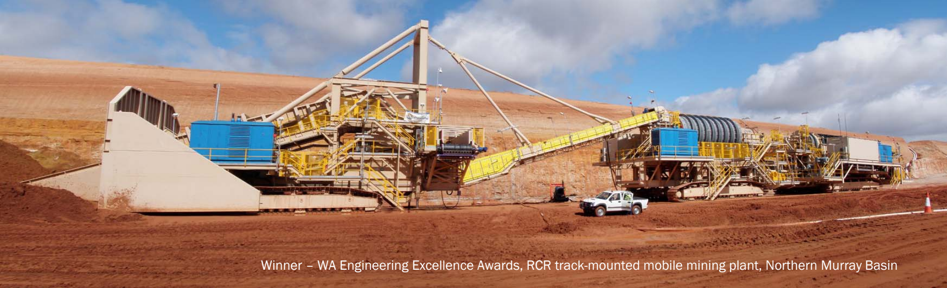
Winner – WA Engineering Excellence Awards, RCR track-mounted mobile mining plant, Northern Murray Basin